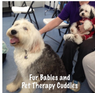
Fur Babies and Pet Therapy Cuddles