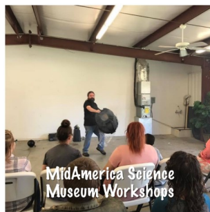
MidAmerica Science Museum Workshops

School may be out, but that only means our kids have the opportunity to experience a safe, fun, and enriching summer at OCC! They've had enrichment classes, gone on field trips, and had unique workshops covering everything from improv drama, juggling and animal balloons, art, writing, martial arts, and science thanks to the amazing talents of community volunteers and organizations. Trips to the lake to swim and fish and the precious dogs that come each month from Pet Therapy have made this summer one to remember for all the right reasons! Your support of OCC gives our kids a sense of normalcy in the midst of the crisis that brought them to us in the first place. Thanks for giving that gift to a young person who needs you!