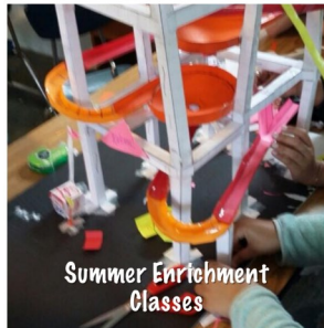
Summer Enrichment Classes