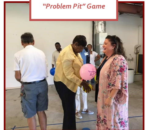
OCC Staff Play the "Problem Pit" Game

OCC never stops, but one week in June included training for our entire staff. Continuing education is imperative for our staff to maintain the skills and knowledge they need to provide the best care possible for the youth in crisis who need our support and our emergency shelter. Not only did we have excellent workshops, but we even took time to play some team building games that were loads of fun, too. Your support of OCC keeps our staff ready and able to take on the challenges faced by our kids.