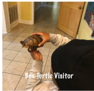
Box Turtle Visitor