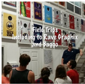
Field Trips Including to Rave Graphix and Baggo