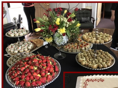
A Beautiful Cake and Delicious Food made the Party Perfect thanks to