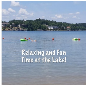
Relaxing and Fun Time at the Lake!