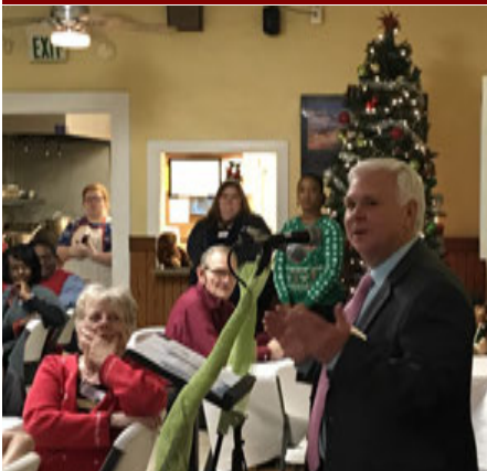
From Our Christmas Party to Throwing Pizza Dough at Deluca's, the Holidays were Great!